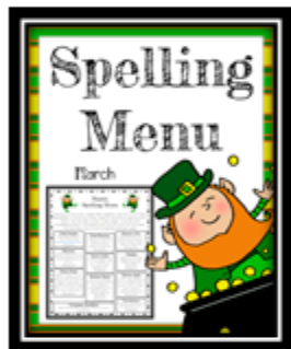
March Spelling Menu